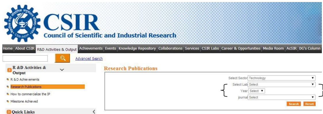
Figure-1: One of the webpages of CSIR giving access to its research publications

http://www.csir.res.in/Home.aspx?MenuId=3